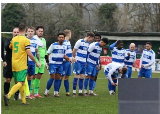
Team Line Up v Godalming Town